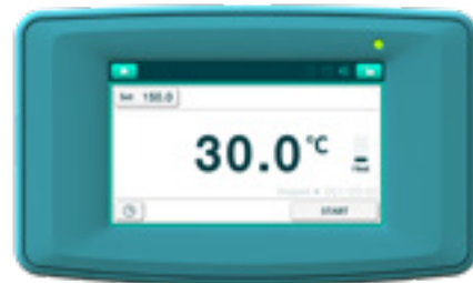
Excellent visibility with 5-inch large LCD