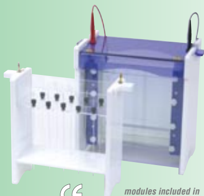
modules included in omniPAGE Maxi 2-D System, VS20C2DS