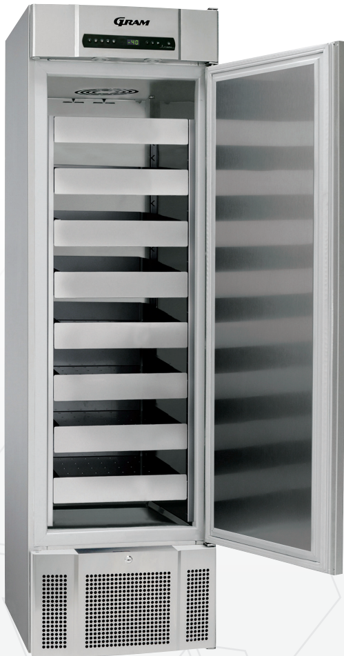
BioMidi EF425. Drawers are optional extras.

The BioMidi EF425 cabinet is a low temperature freezer that operates in the temperature range -5/-40^{\circ}\text{C} . It is a high capacity ventilated refrigeration unit that makes sure the interior quickly returns to the specified temperature after the door has been opened.