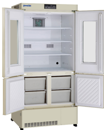
MPR-715F-PE with optional MPR-715SC-PW