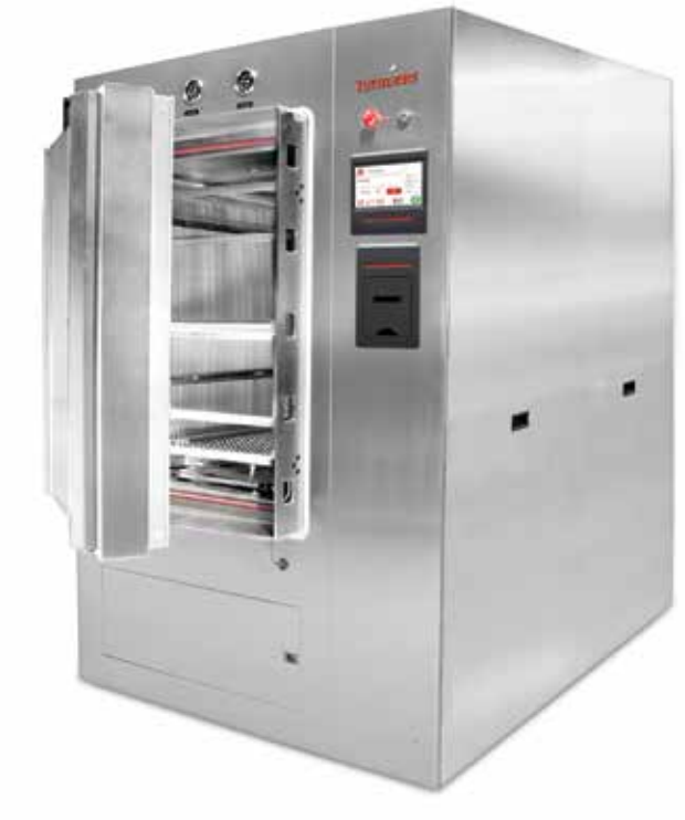
Automatic Hinged Door